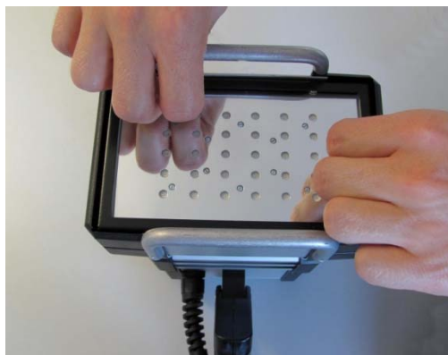
Fig. 3: Removing the protective glass unit

CAUTION: Do not loosen the two outer screws!